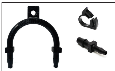
Roll' N Grow MCX