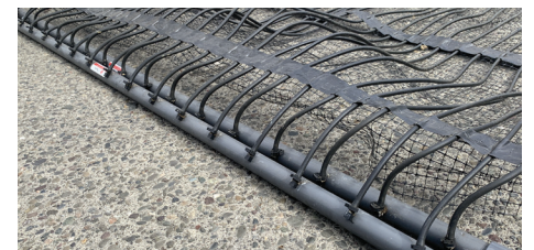
Roll' N Grow manifold