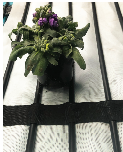
Roll' N Grow MTX