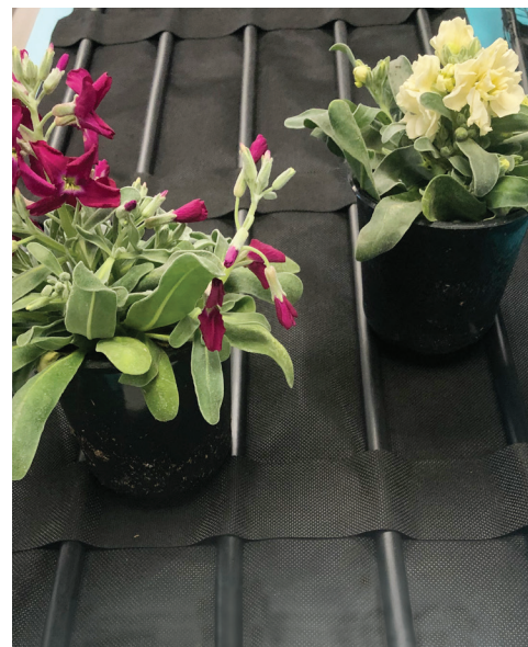
Roll' N Grow MCX