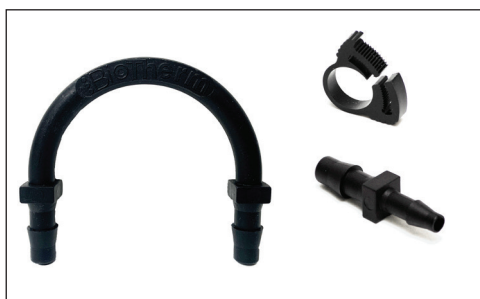
Roll' N Grow MTX