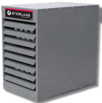
XF/XC Series 83% Thermal Efficiency Size Range: 100-400 MBTUH NG/LP Compatibility