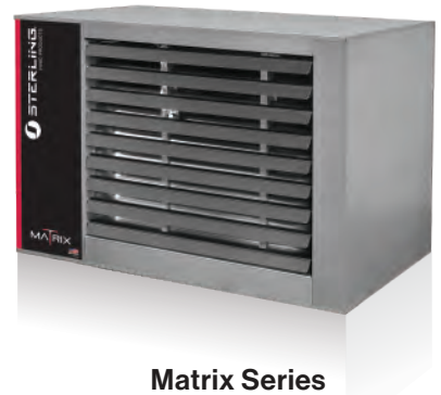
Matrix Series 93% Thermal Efficiency Size Range: 50-400 MBTUH Gas-Fired, Condensing Unit Heater