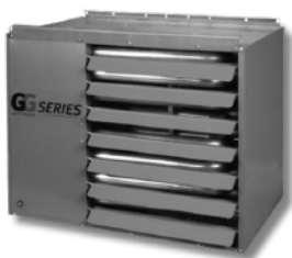
GG Series 82% Thermal Efficiency Size Range: 30-120 MBTUH NG/LP Compatibility

We offer a unit heater model for every size facility, designed to match the same models currently available on the market while providing enhanced efficiency and competitive pricing.